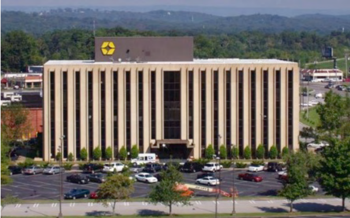
UPTAIN BUILDING 5751 UPTAIN ROAD CHATTANOOGA, TN 37411

Luken Holdings, Inc. 735 Broad St. Suite 1204 Chattanooga, TN 37402