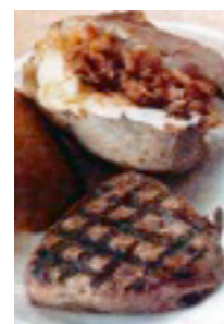
LOADED POTATO BEEF TIPS